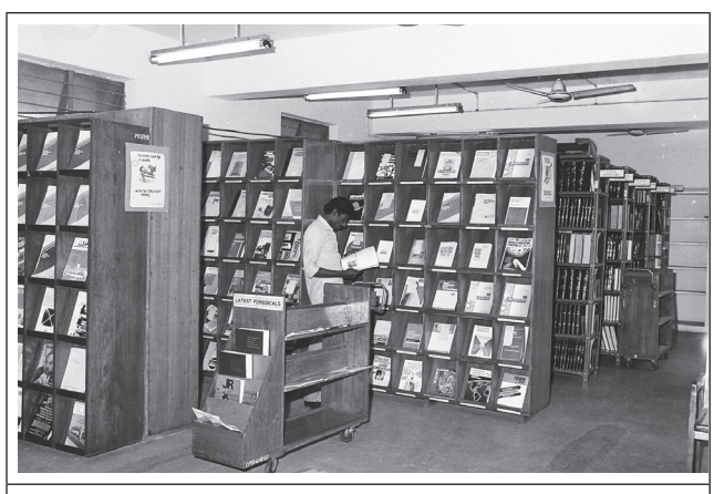
OLD LIBRARY 1980s