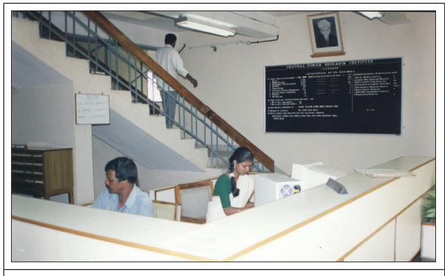
CIRCULATION SECTION OF OLD PREMISES

Library and Information Centre changed with reference to development in technology. In 1992 Library and Information centre started automating its collectionby using CDS/ISIS. During 1998 changed over to LIBSYS Software and converted data from CDS/ISIS. Now it has its credit that Library is completely automated. 2003 Digital Library and Knowledge Management Systems for CPRI - project was taken up along with Information Technology and Implementation Division and completed in 2005. During the project period a subcommittee was formed and as per the recommendations of the committee about 30,000 pages of documents published by CPRI was scanned and uploaded in Digital Library. Library and Information Centre is uploading bibliographic details of articles from the journals to facilitate the researchers. Few publications with prior permission from