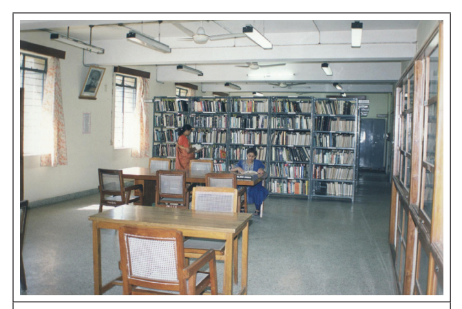
BOOK SECTION OF OLD PREMISES

the online searches through other sources such as Informatics India Pvt. Ltd. and NCSI, IISc, Bangalore.