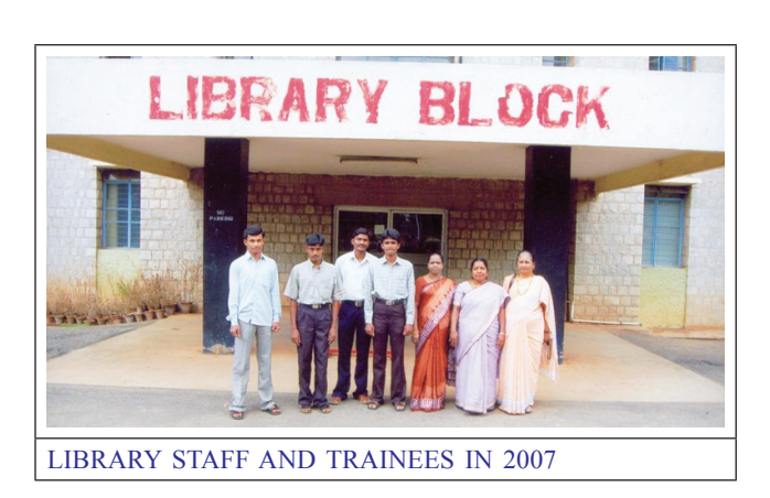
Currently libraries are treated as the gateways to Knowledge resources, centre for creation and recreation of activities and similarly librarians as knowledge manager or interpreter of thought contents. Pursuant to this, presently librarians are not only involved in the collection building of printed resources but also to make all necessary arrangements to procure digital resources, create e-information environment to manage enhanced and diversified information needs of users under digital era. Realizing the importance of this fact, the Library and Information Centre is engaged in creating the infrastructure and environment so that excellence in the institutes' mission is achieved

In order to facilitate the reader and the organization, Library and Information Centre, Bangalore, has been rendering services to all its units and divisions. CPRI with its head office at Bangalore, has its other units at Koradi, Nagpur, Hyderabad, Bhopal, Noida, Kolkata and Guwahati. The library has been creating infrastructure for R&D and testing in a phased Manner, over the last five decades.