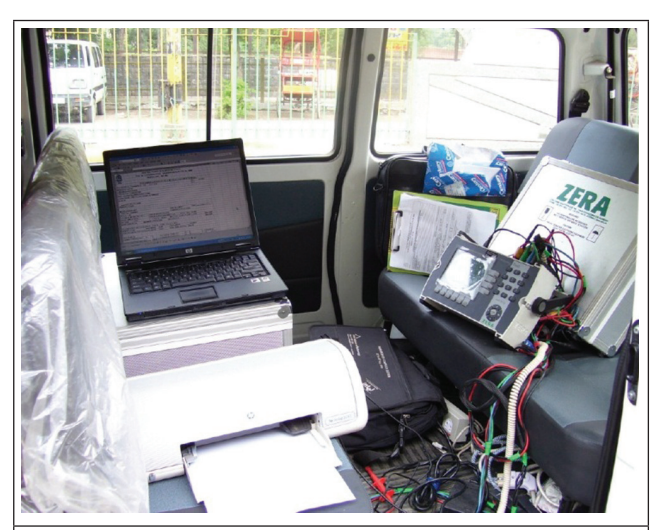
MOBILE ENERGY METER TESTING LABORATORY (IN SIDE VIEW)