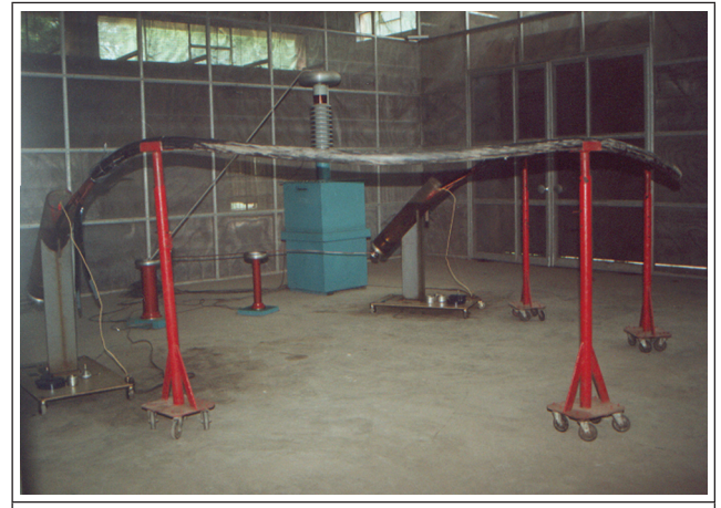
PARTIAL DISCHARGE TEST SET UP