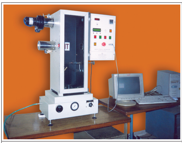
100 kV SMOKE DENSITY TEST APPARATUS