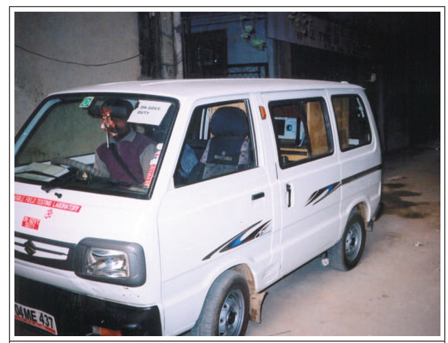
MOBILE ENERGY METER TESTING LABORATORY (OUTSIDE VIEW)