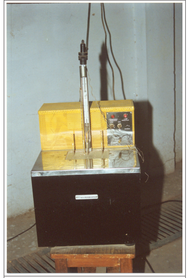
THERMAL STABILITY TEST APPARATUS

The laboratory is equipped with facilities to carry out testing and certification of mineral insulating