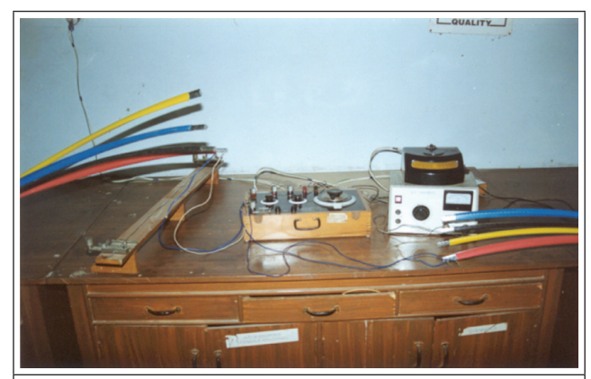
KELVIN DOUBLE BRIDGE (CONDUCTOR RESISTANCE TEST)