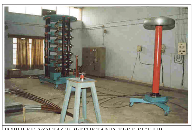
IMPULSE VOLTAGE WITHSTAND TEST SET UP