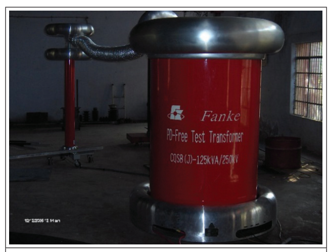
250 kV 125 kVA PD FREE TRANSFORMER