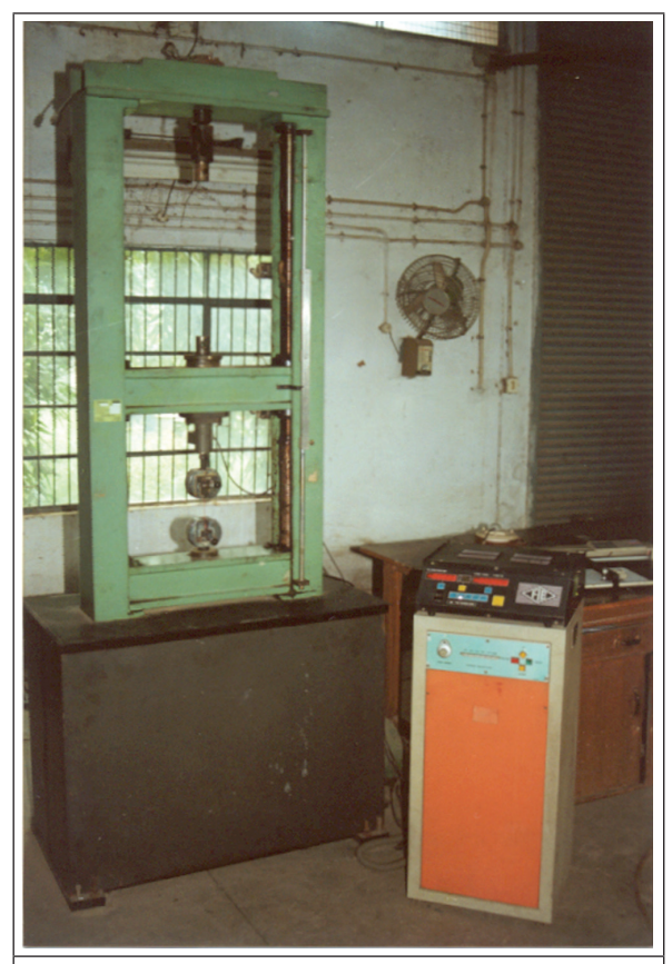
UNIVERSAL TESTING MACHINE (FOR TENSILE STRENGTH TEST AND ELONGATION TEST)