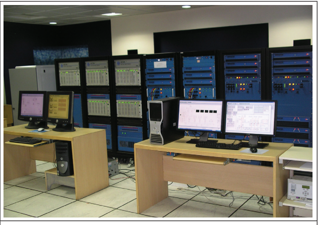
FIG. 3 REAL TIME DIGITAL SIMULATOR

RTDS with its Real Time Simulation capability is the most flexible and efficient means for testing control equipment. The flexible and abundant signal input and output structure available on the RTDS Simulator facilitates the high volume of signal transfer required when testing complex controllers.