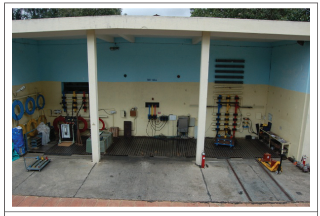
PHOTOGRAPH SHOWING THE SHORT CIRCUIT TEST BAYS

Many facilities were added from now onwards. Routine test facilities for transformers, CTs