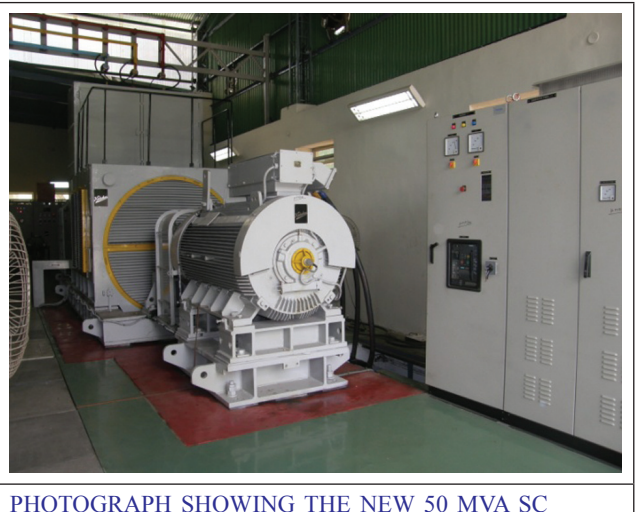
PHOTOGRAPH SHOWING THE NEW 50 MVA SC GENERATOR WITH DRIVE MOTOR AND VFD

The project was started during the year 2008 under the 11th plan capital project and was completed during the year 2010. It was for first time the SC test facility was indigenously designed, manufactured and commissioned in the country. The new set-up consisted of 50 MVA SC generator driven by 690 V induction motor supplied through a variable frequency drive (VFD). Because of the VFD the testing can also be carried out at 60 Hz frequency which is