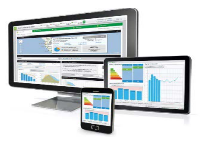
Figure 7. Apps, Analytics and Services.

These are used today in extreme climatic conditions and have shown excellent capabilities by performing well in industries like Oil & Gas, Mining, Railways among others.