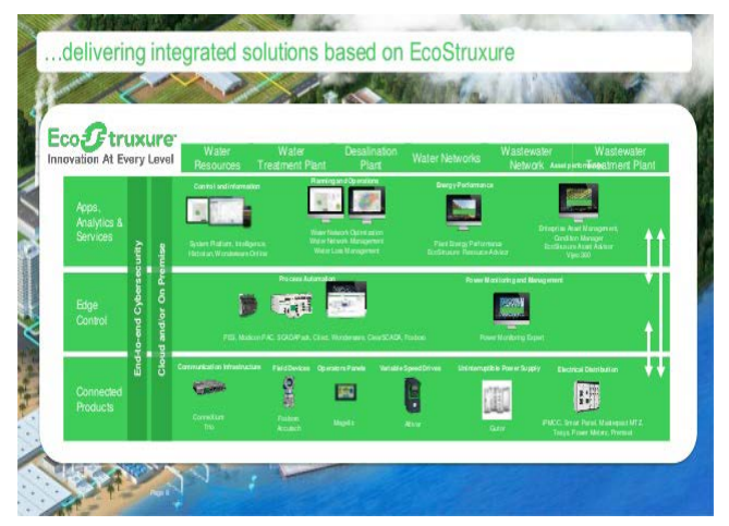
Figure 4. EcoStruxure<sup>™</sup> overview.

The first layer is connected products with embedded intelligence, such as sensors, medium and low voltage breakers, drives and actuators.