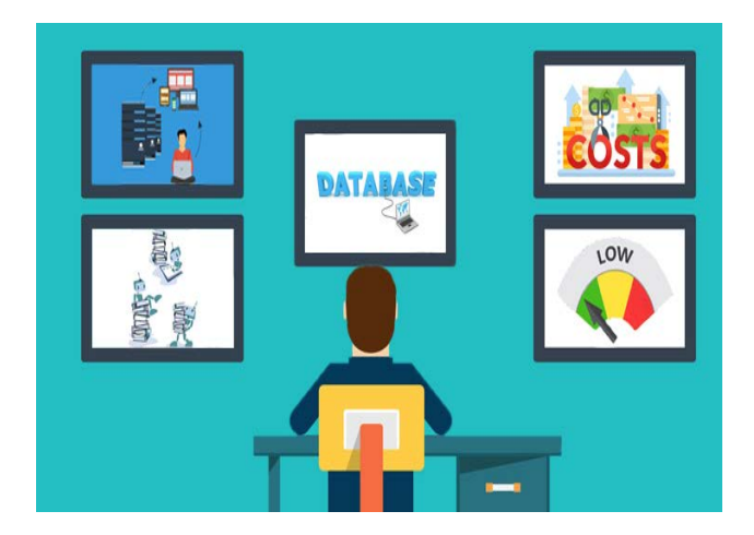
Figure 1. Representing benefits of digitization.