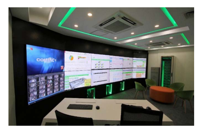
Figure 2. Smart, connected devices are the first step in a completely digitized power distribution system.

Facility teams should be taking full advantage of the many applications and benefits that digitization now enables. Without a fully connected and intelligent power management system, facility teams are 'working blind', unaware of the many risks that may be threatening business continuity and efficiency. The steps to implementing such a solution can be extremely costeffective considering all the dimensions of ROI that can be achieved in a very short payback period. Many of the pieces may already be in place in most facilities, such as