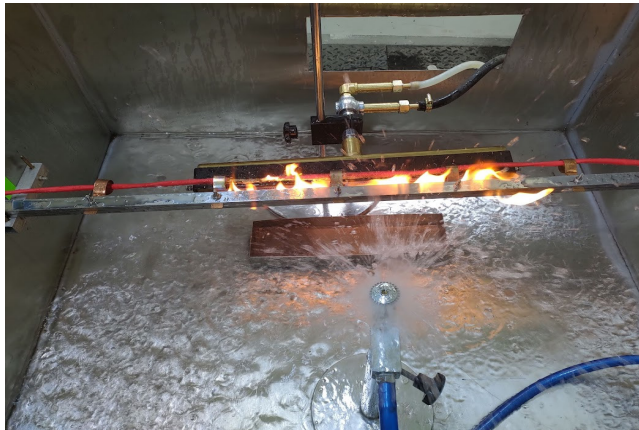
Figure 4. Resistance to fire with water on glass mica tape insulated cable.