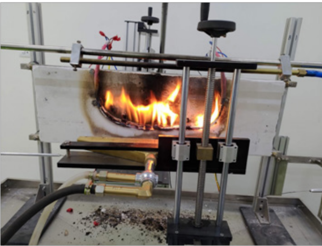
Figure 6. Resistance to fire with mechanical shock on silicone rubber insulated cable as per BS EN 50200.