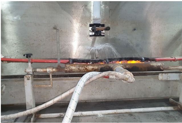
Figure 3. Resistance to fire with water on glass mica tape insulated cable.

Figures 3 and 4 show the resistance to fire with water test carried out on glass mica tape insulated and silicon rubber insulated cables as per protocol W of BS 6387.