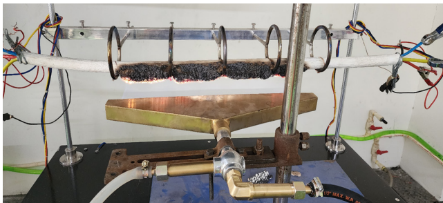
Figure 1. Resistance to fire alone on fire retardant coating/paint-coated cable.